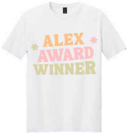
ALEX AWARD WINNER T-SHIRT 100% RING SPUN COTTON