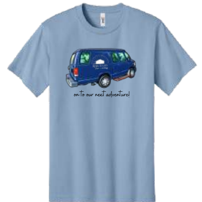
SPECTRUM VAN T-SHIRT 100% CARDED RING SPUN COTTON