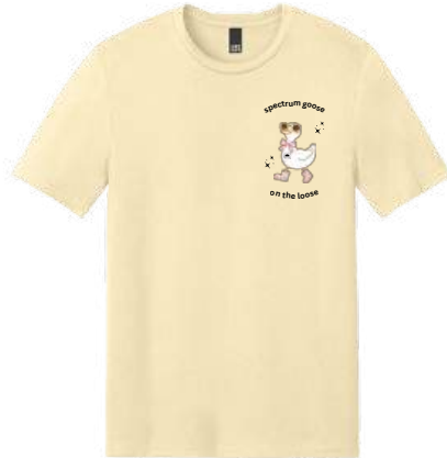
SPECTRUM GOOSE T-SHIRT 60/40 COMBED RING SPUN COTTON/RECYCLED POLYESTER