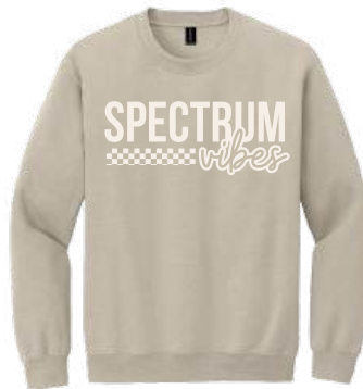
SPECTRUM VIBES CREW NECK 50/50 COTTON/POLY