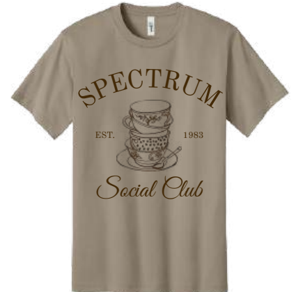
SPECTRUM SOCIAL CLUB T-SHIRT 100% RING SPUN COTTON