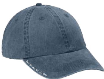
SPECTRUM BASEBALL CAP