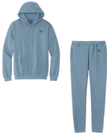
STEEL BLUE HOODIE & SWEATPANTS 80/20 RING SPUN COTTON/POLY ITEMS SOLD SEPARATELY (SWEATPANTS RUN SMALL - SIZE UP FOR AN OVERSIZED LOOK)